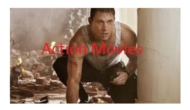
Jack Reacher Never Go Back Movie Tamil Hd 1080p